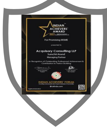
Promising MSME - 2022

Acquisory Consulting LLP has been ranked amongst top 5 M&A Advisory firms in Venture Intelligence League Table.