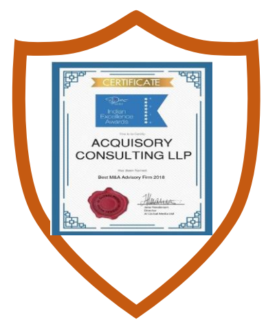
Best M&A Advisory Firm - 2018

Acquisory Consulting LLP received the Indian Achievers' award for "Promising MSME – 2022".